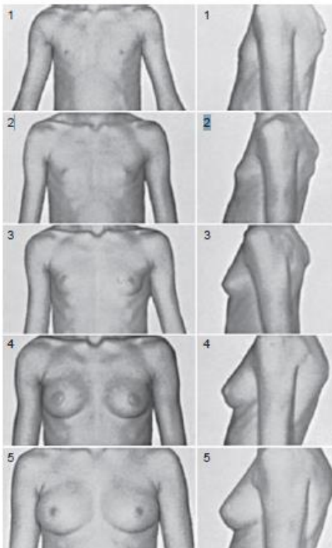
Figure 1:-Tanner stages (1-5) of breast changes in Adolescent females.

Stage 5: B5:Adult(Mature stage: fully developed breast, nipple projects, areola part of general breast contour)